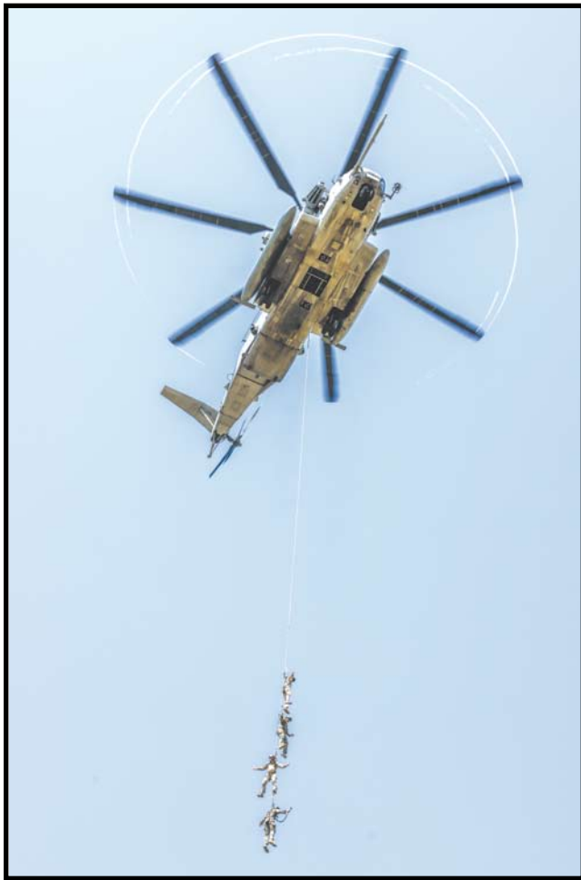
CAMP PENDLETON (July 16, 2024) U.S. service members suspend from a CH-53E Super Stallion with Marine Heavy Helicopter Squadron (HMH) 466, Marine Aircraft Group 16, 3rd Marine Aircraft Wing, during a special patrol insertion and extraction exercise here. The Helicopter Rope Suspension Techniques Masters Course 24-3 helps to rapidly insert and extract forces when landing a helicopter is not feasible.