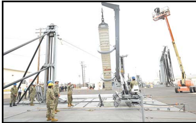
Sailors guide a missile canister using the Navy's Transferrable Rearming Mechanism as they demonstrate the ability to reload a Vertical Launching System cell on July 11 at Naval Surface Warfare Center, Port Hueneme Division's Underway Replenishment Test Facility.

The rearming mechanism uses a crane that can lift and rotate 25-foot missile canisters vertically, then lowers the explosives into the launchers, which are small openings in the ship deck. The system is designed to be used with existing at-sea replenish-