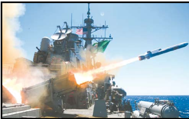
MISSILE IN MOTION Sailors fire a simulated naval strike missile aboard USS Fitzgerald during Exercise Rim of the Pacific in the Pacific Ocean, July 18, 2024.