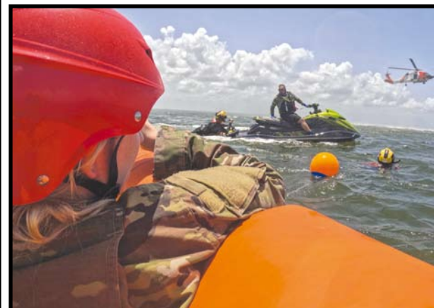
MACDILL AFB, Fla. (July 22, 2024) A U.S. Airman participates in a water survival training exercise near here. The training exercise was part of the Air Force's Survival, Evasion, Resistance and Escape curriculum designed to prepare aircrew members for escaping a downed aircraft in open water.

NEAR HAWAII (July 17, 2024) Legend-class cutter USCGC Midgett conducts an air raid exercise with a U.S. A-10C Thunderbolt II (shown here), Italian