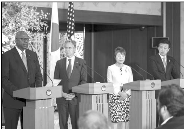
Secretary of Defense Lloyd J. Austin III and Secretary of State Antony J. Blinken conduct a press briefing with Japanese Defense Minister Minoru Kihara and Foreign Minister Yoko Kamikawa after the U.S.-Japan Security Consultative Committee meeting in Tokyo, July 28, 2024.

According to a joint statement by the Security Consultative Committee, meeting participants discussed co-production opportunities to expand produc-