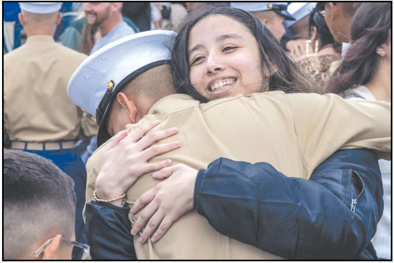
RECRUIT HUG A Marine with Mike Company, 3rd Recruit Training Battalion, is greeted by his guest following his graduation ceremony at Marine Corps Recruit Depot San Diego on Nov. 15, 2024. Graduation took place at the completion of the 13-week transformation, which included training for drill, marksmanship, basic combat skills, and Marine Corps customs and traditions.

SIXTY-FOURTH YEAR NO. 34 DECEMBER 8, 2024