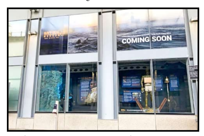
The future Navy SEAL Museum of San Diego.