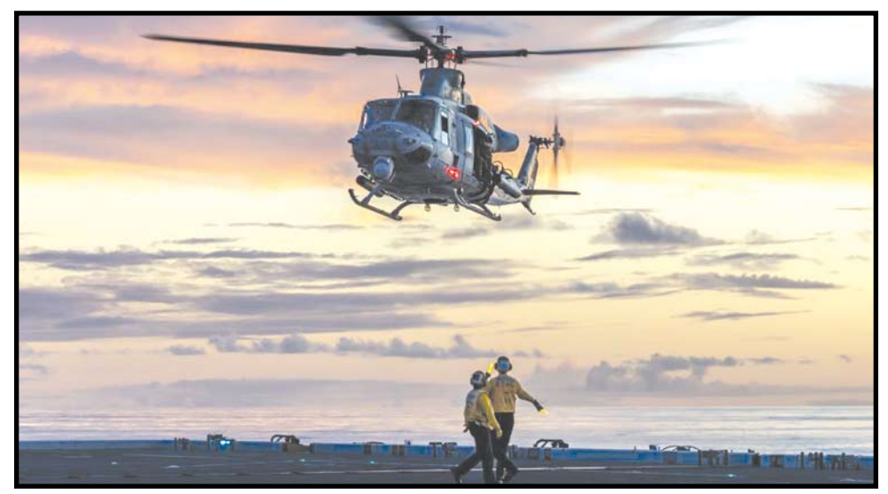
A Marine Corps UH-1Y Venom prepares to land aboard expeditionary sea base USS Miguel Keith in the Philippine Sea on Sept. 28, 2024.

"When we say 'expeditionary,' part of that means being able to react quickly and get to places quickly," Harper said. "The other aspect is being able to distribute not just for a short amount of time, but for a sustained amount of time. And so, using these newer or different forms of ships to move Marine forces and support Marine